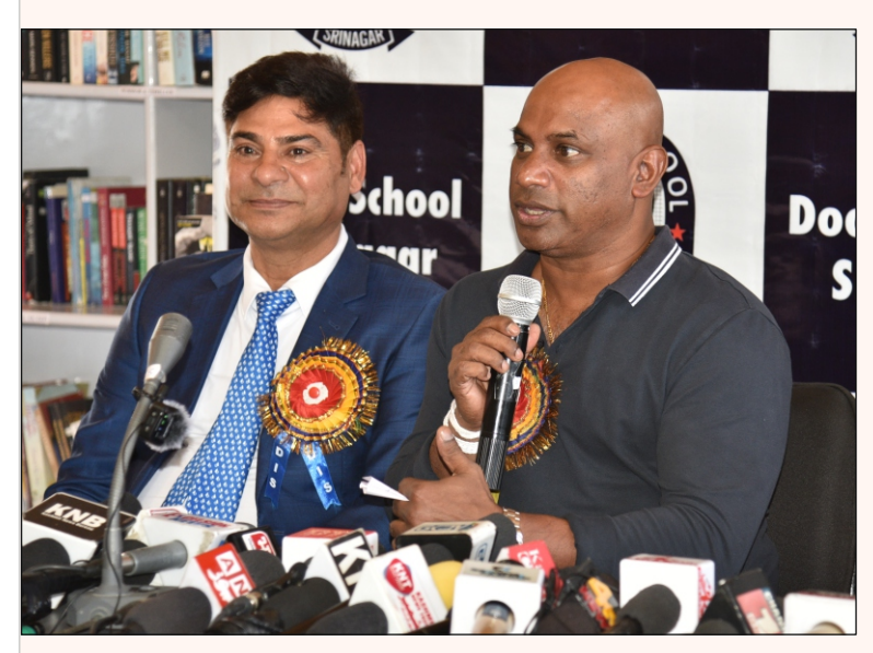
"The school is doing its best for the students and the parents are lucky to have their wards enrolled in DSS"