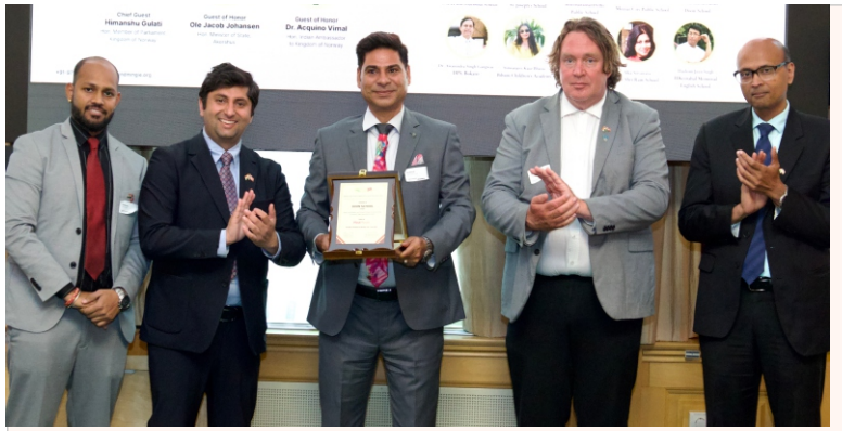
Award for Transformative Education Excellence by Norway Government - 2024

Indo-Norway International Education Summit and Awards - 2024 Venue: Stortinget (Parliament of Norway), Oslo, Norway