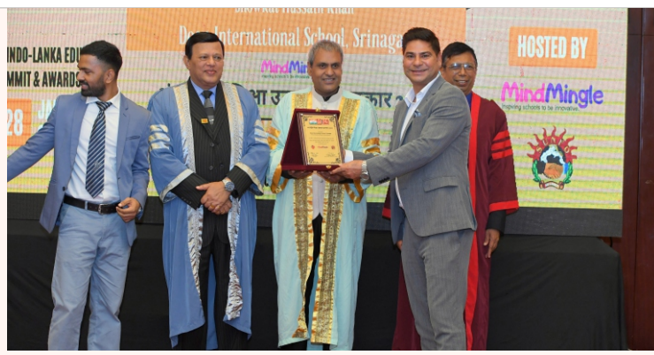
International Award for Excellence in Education by Sri Lankan Govt - 2023

Indo-Norway International Education Summit and Awards - 2024 Venue: Stortinget (Parliament of Norway), Oslo, Norway