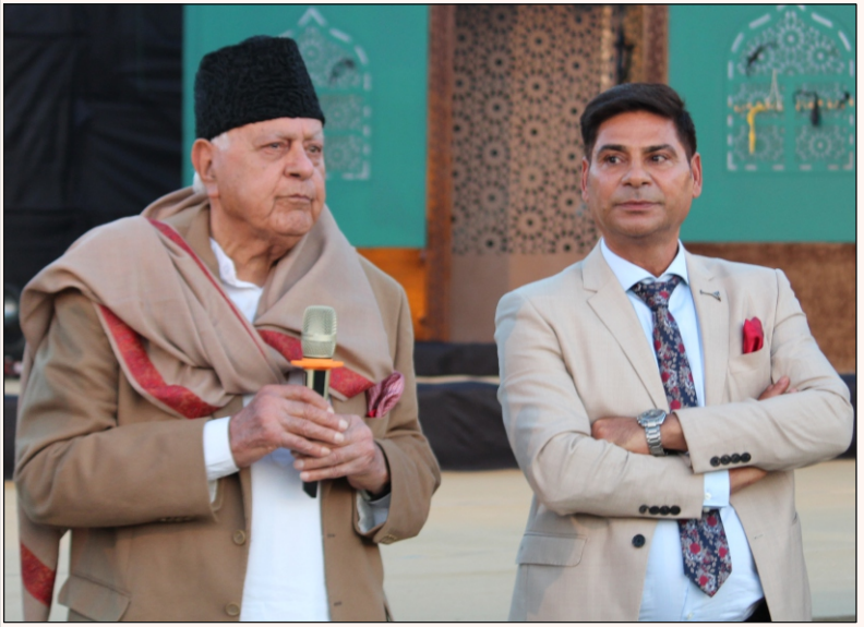
Dr. Farooq Abdullah (President National Conference) "A good school with good infra-structure. The people of valley are lucky to have schools like Doon School Srinagar"